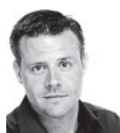
COMMENTARY Scott Maxwell SENTINEL COLUMNIST

Stapp's back. Orlando's native (and fallen) son Scott Stapp performed the national anthem and debuted a new, clean-cut look, complete with a crew cut. The bright-eyed, upbeat persona marked a stark contrast from the for-